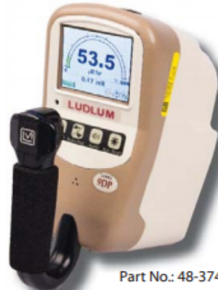
Part No.: 48-3742

NOTE: This instrument is considered HAZMAT and requires HAZMAT training to ship. Please see the instrument manual for details.